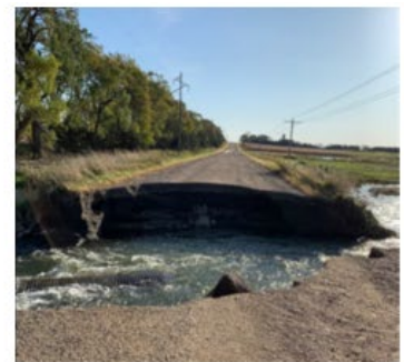
Figure 2. Work in water due to a road collapse may require US Army Corps of Engineers NWP or 401 or 404 depending on the method of repair.