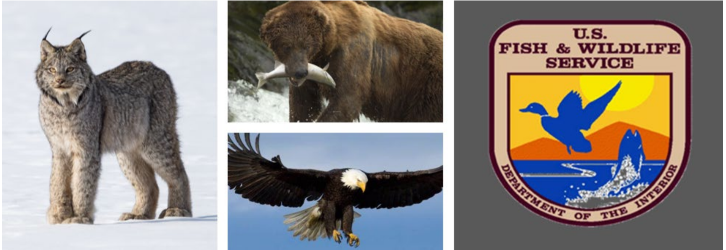
Figure 3. Montana has many protected species, such as the Grizzly Bear, which may require FEMA to consult with USFWS.